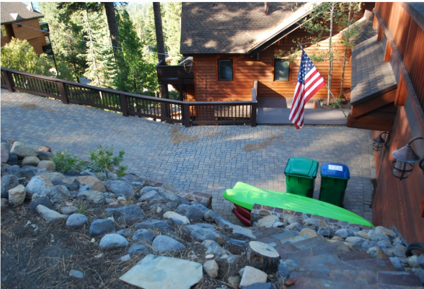
Stairs Accessing Residence