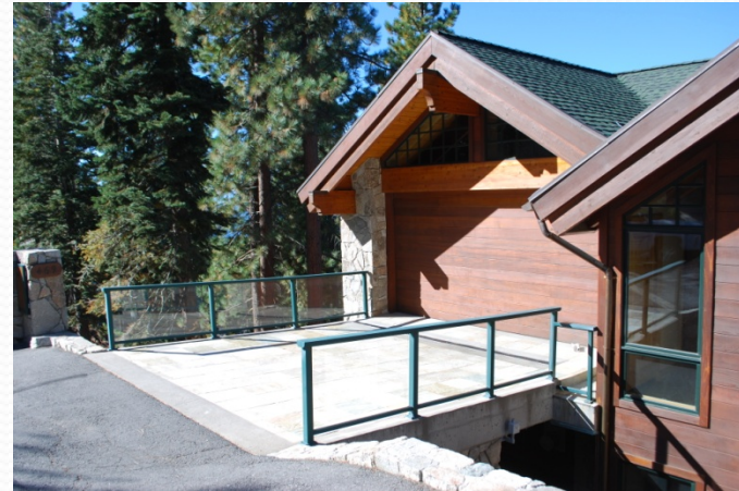
Typical Fairview Residences